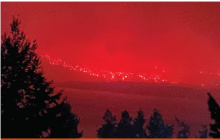
White Rock Lake Fire: Okanagan Lake