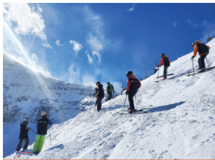
"This is our classroom!"

Another great season is just around the corner for LSA. We begin the season with two weeks of Aquafit and Crossfit, before hitting the slopes at Castle Mountain, December 10th. This year we have 65 student-athletes in the program, including international students from Denmark, Spain and Germany. We have several returning coaches and a few new coaches to complement the ranks. We are very happy to be sharing coaches with both Westcastle Race Club and Castle Mountain Freestyle Club this season. Our new 'Homegrown Coaches' program is underway with seven high school students participating in nutrition, fitness, coach development, avalanche training and ski instructor certification courses. We also have a small