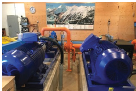
Snow Making pumps can push up to 800 gallons of water per minute

Operating in cold temperatures is challenging. Extreme cold can freeze up equipment and water lines. Warm temperatures can turn